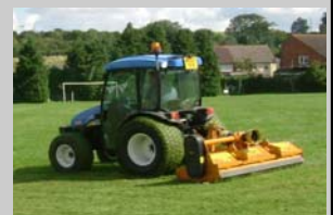
New tractor and flail mower

Having a flail mower means that particularly long areas can be cut, and in wet weather the quality of the cut is much better than with the old motor mower.