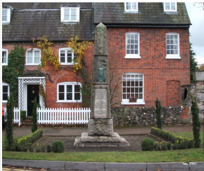
Wiltshire War Memorial

Alongside the pavement there is now a hedge of forty Remembrance roses, a deep red long lasting rose, which will really stand out next to the green of the grass